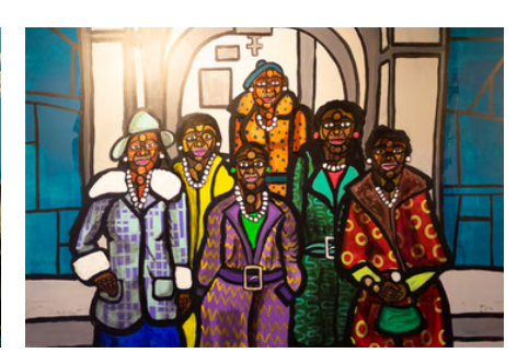
A selection of murals from "The Black Vote Mural Project".