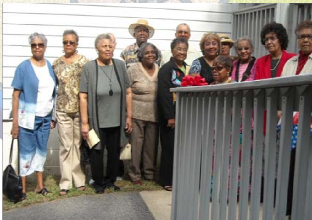
Former Students at Queenstown Rosenwald School