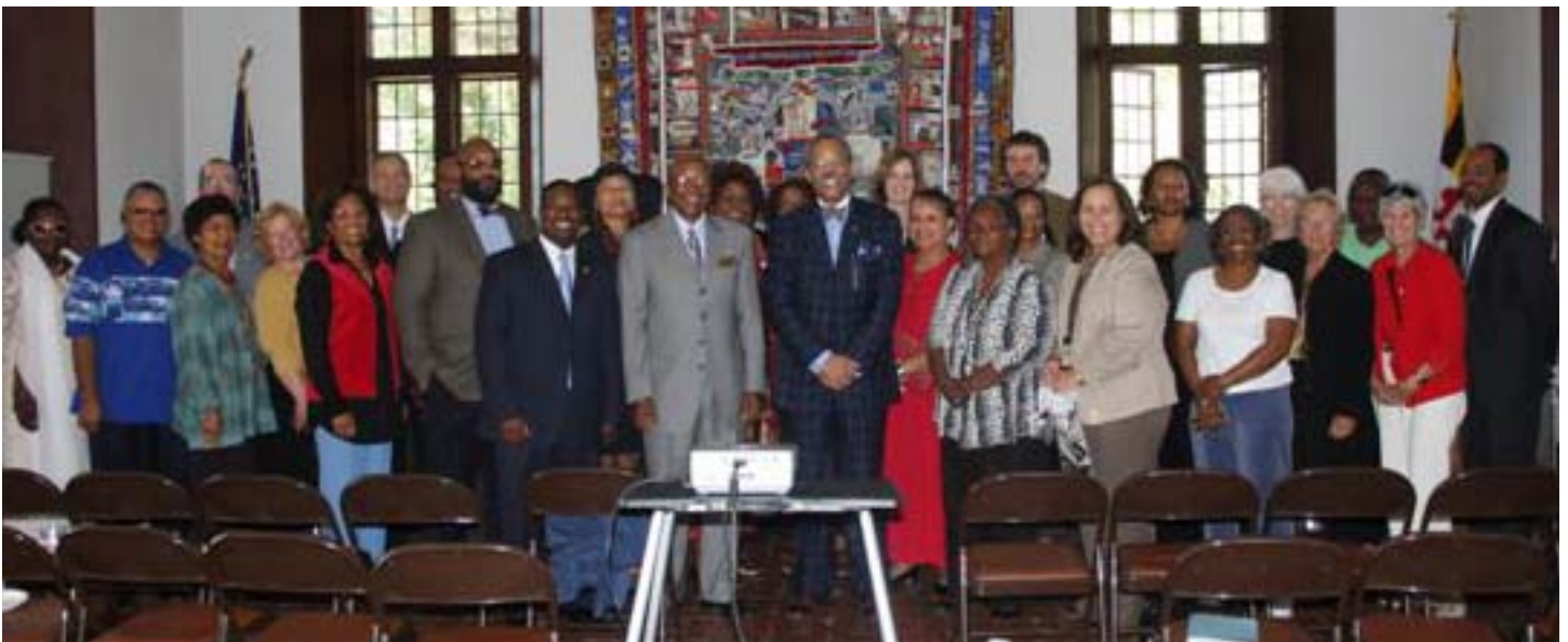
MCAAHC Meeting, The State House of 1676, Historic St. Mary's City, September 20