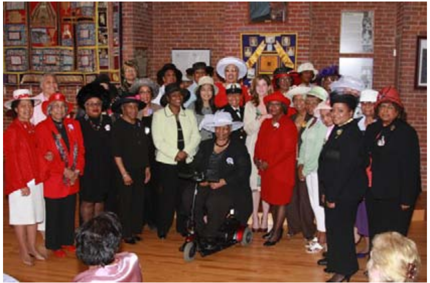
Participants of Ladies Hats and Tea