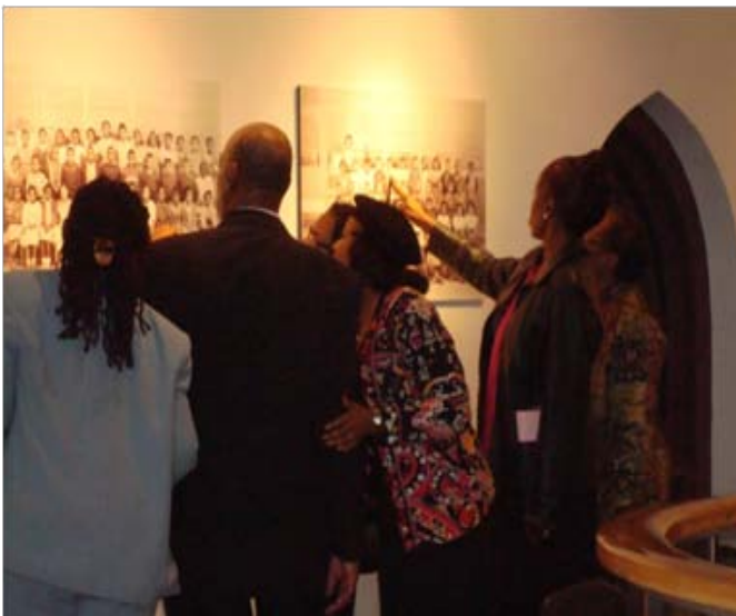
Members of the community enjoy Class of 1954

The pictures exhibited on this floor of the exhibition show the faces of Parole Elementary School in 1954, the year of the Brown v. Board of Education decision. Identification sheets were located in the exhibit to allow community input.