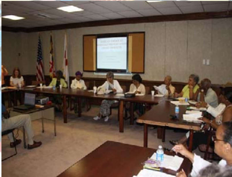
African American Heritage Preservation Grant Workshops, June 5 & June 12