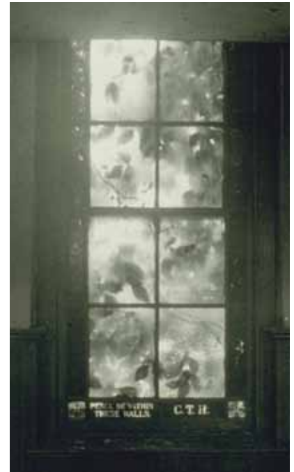
Above: Original stained glass window that inspired the exhibit title.