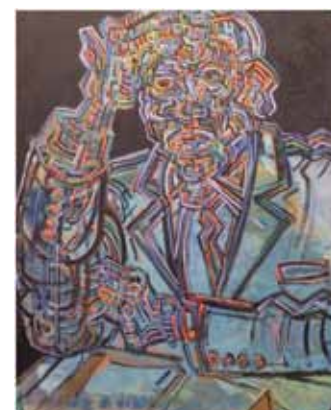
Exegesis, 2008, Acrylic, 38" x 30"

This exhibition consists of over thirty paintings. The artist uses concentric shapes, bold, layered lines and arresting colors to give voice to the ambiguities of life while searching for spiritual peace.