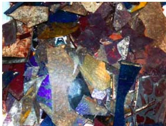
Fragments of Stained Glass

The piece, entitled “Peace Be Within These Walls,” is meant to be a work of art that chronicles the museum’s thirty years, while speaking to larger themes. A work of art that speaks to our spirit, touches our soul, and looks forward to the next chapter in our history. The piece will be unveiled during the museum’s 30th Anniversary Celebration, on February 22, 2014. After, it will then permanently installed in the museum’s lobby with custom lighting.