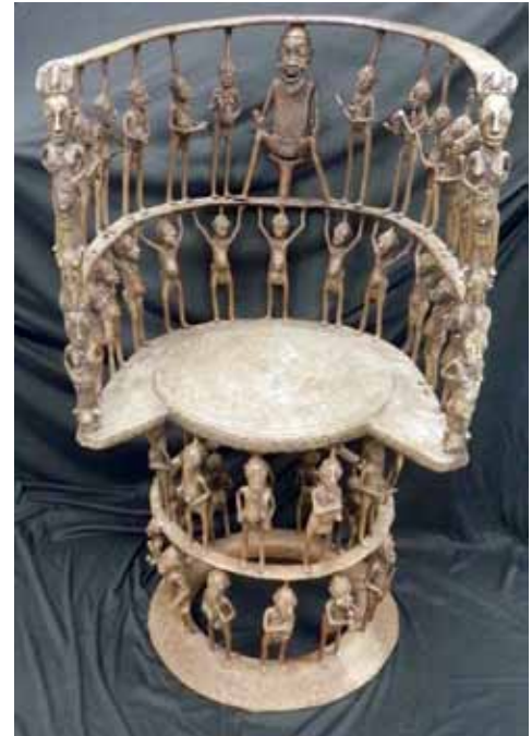
Bamileke Bronze Judgement Chair