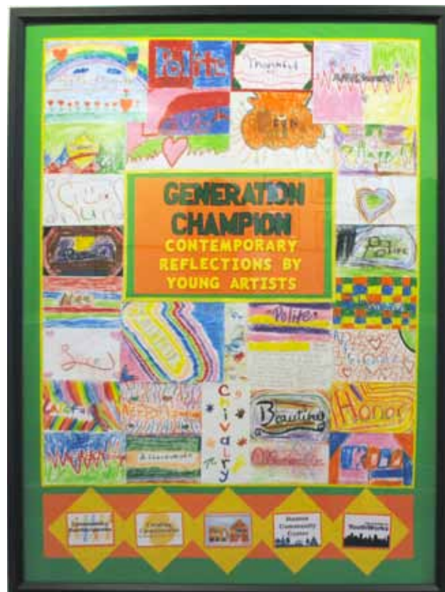
Above: Pastel canvas art created by youth participants.

Left: sampling of the students' activities. at the Creating Communities youth camp. Below: Newspaper collage consisting of various headlines throughout the 120+ years of the Afro-American Newspaper's history.