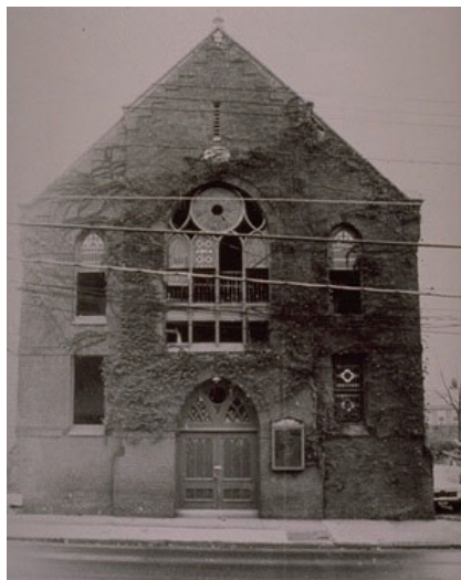
Mt. Moriah AME Church circa 1975

With the arrival of the upcoming 30th Anniversary in 2014, the Banneker-Douglass Museum staff wanted to do something that would commemorate the history of 84 Franklin Street, which has remained at the center of the community – not as a church, but as the collectors and tellers of Maryland’s African American history.