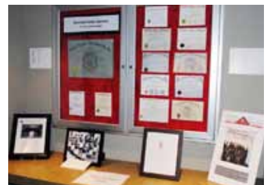
Above: Delta Sigma Theta Quilts on display