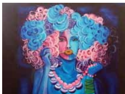
Beautiful, 2012, Acrylic, 36" X 48"

February 23, 2013 - September 14, 2013, Temporary Gallery