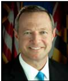
MARTIN O'MALLEY GOVERNOR

STATE HOUSE 100 STATE CIRCLE ANNAPOLIS, MARYLAND 21401-1925 (410)974-3901 (TOLL FREE) 1-800-811-8336