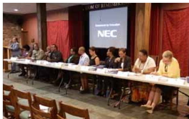
MCAAHC Regular Meeting—Union Baptist Church