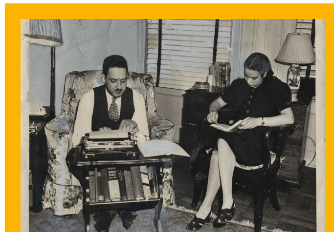
Mr. & Mrs. Thurgood Marshall Featured in the exhibition REVISIT/REIMAGINE: The Civil Rights Era in Maryland and Parallels of Today